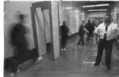
Florence correctional center, Florence AZ